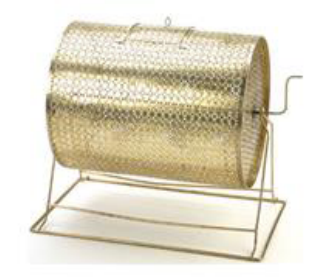
Donation $5.00 per ticket

Homestead Run Clubhouse 100 Fireside Blvd., Toms River, NJ 08755 Winner need not be present. No substitution of offered prize may be made.